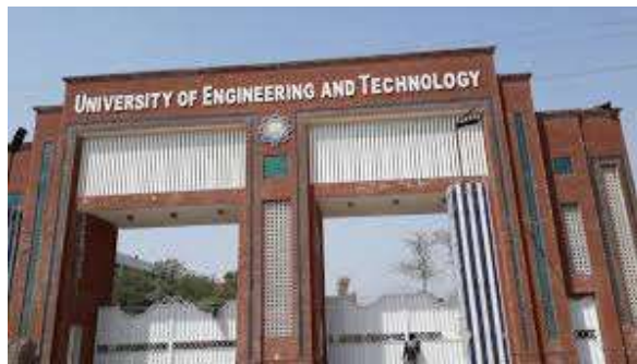
Figure 1.1 Main Entrance to UET Lahore.

It is recommended that Captions feature of MS Word is used for figures and tables for automatic creation of List of Figures and List of Tables. MS Word help documentation or other sources may be consulted for the use of captions.