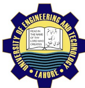
Figure 1.2 UET Logo